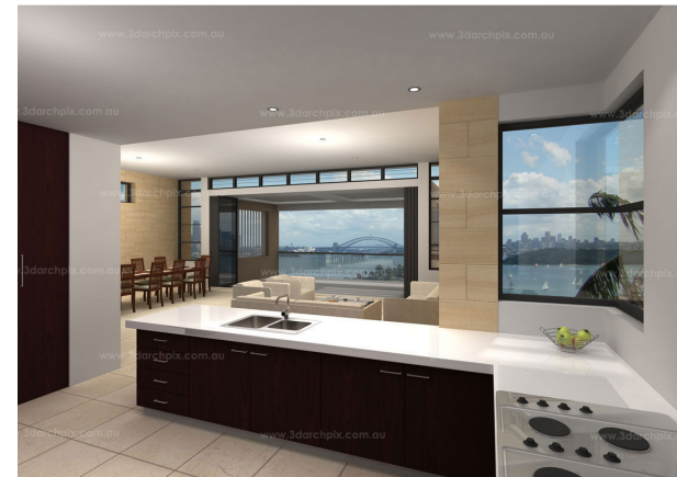
3D Interior Images